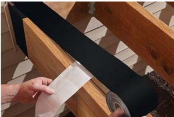
Protect Joists with tape.