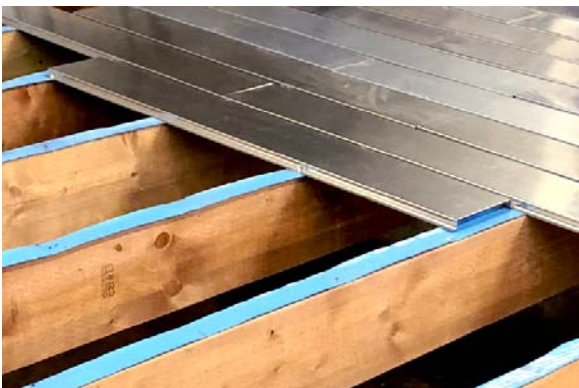
Screw Paverdeck into joists.